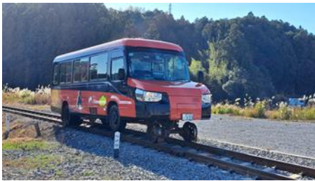
A train is running on the tracks

The other day, I went to Tokushima Prefecture to see the DMV. DMV is an abbreviation for "Dual Mode Vehicle," and it is a vehicle that is modified from a microbus and equipped with wheels for running on tracks, and can switch modes between a train on the tracks and a bus on the road. This will be the world's first full-scale commercial operation. The Asa Kaigan Railway operates between Kaiyochi, Tokushima Prefecture and Toyocho, Kochi Prefecture, with one round trip per day to Muroto on Saturdays, Sundays, and holidays. If you are interested in trains, please come visit us.