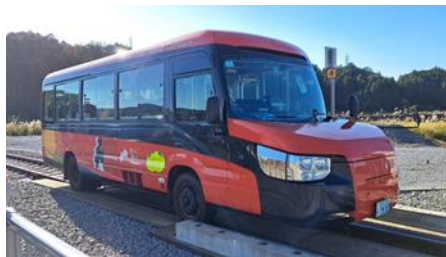
Transformation to bus mode