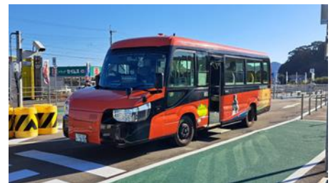
Depart by bus!